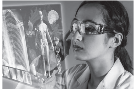
Light guide plate for smart glass